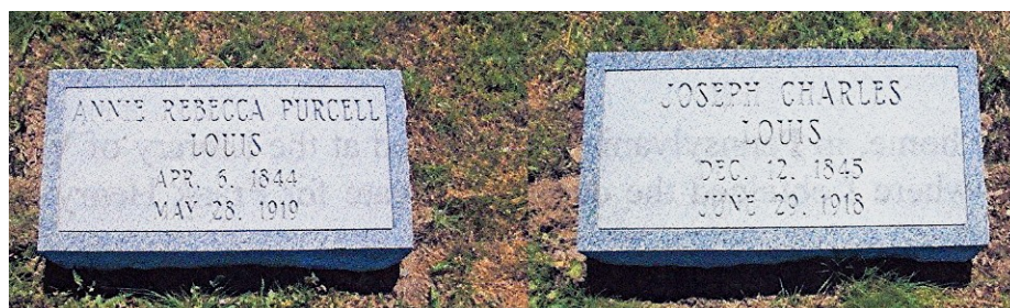
These two stones were delivered and placed on May 5, 2010