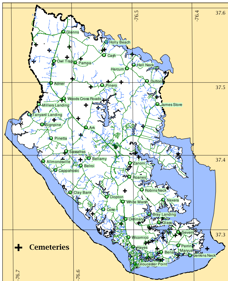
GIS map on Gloucester website showing cemetery location with latitude and longitude.

The adjacent map shows the Cemeteries/Grave Sites , but not the Cemeteries (Full Tax Parcel) . The list of cemeteries follows with an explanation of abbreviations used.