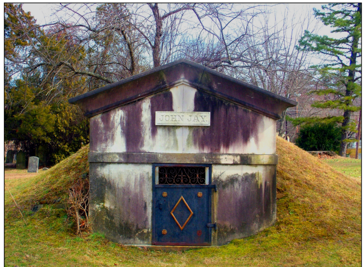
Crypt of John Jay, the first U.S. Supreme Court Justice, located near the Hartman's home when they lived in Maryland.

For many years, since I was a child, I have wondered where my great grandparents had been buried. I imagined them having been buried somewhere on the old Hartman Farm at Broad Creek in Princess Anne County. A trip to the old farm in 2001 revealed that it is now